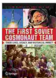
Image alt: Cover of 'Their Lives and Legacies' book featuring a collage of portraits of influential figures from history.