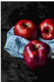
Image of book cover with alt attribute: "The Apple Photos For Photographers" by [Author's Name]