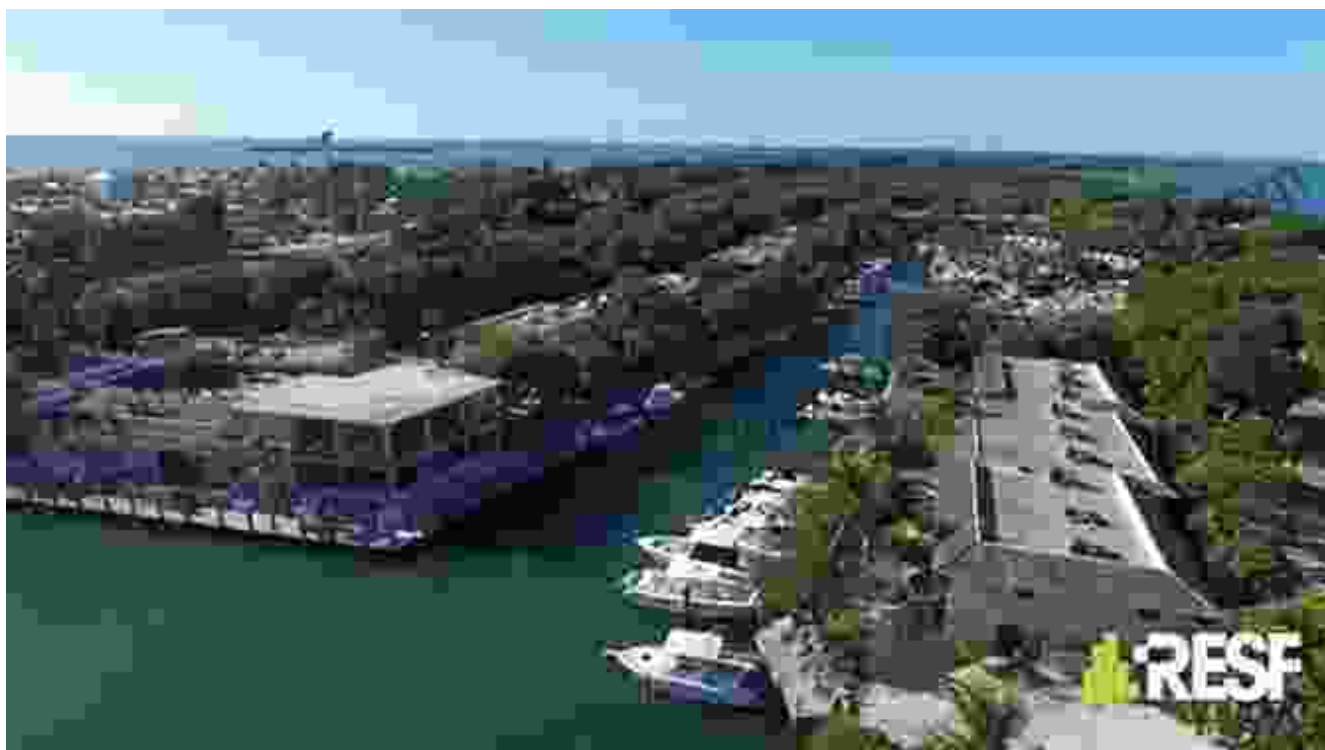
image invites you to immerse yourself in the natural splendor that defines the Florida Keys.

An aerial view of Key Largo from "An Aerial Archive of the Florida Keys," highlighting the island's lush vegetation and the surrounding turquoise waters.