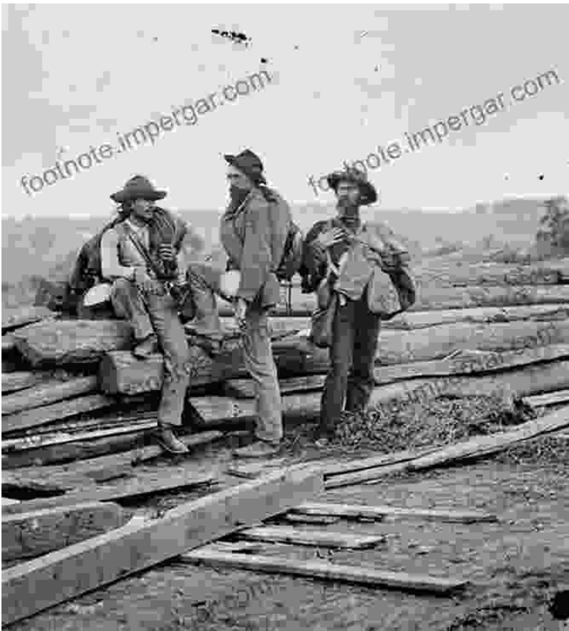
Triumph and Trophy at the Battle of Antietam

providing a deeper understanding of the strategies, tactics, and human toll of the war.