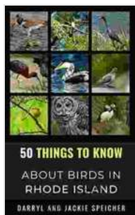
Image Credits: All images used in this article are licensed under Creative Commons.